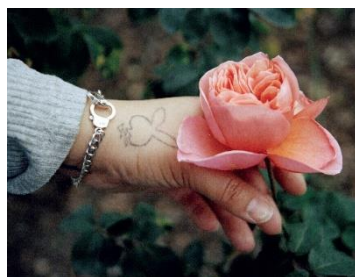
Ira Lupu, Armed